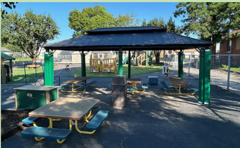
Granite City South