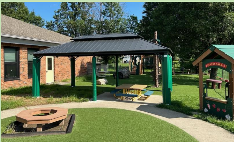
Granite City North

We're thankful for those who worked hard to make this happen and we look forward to our teachers and students being able to use the pavilions for many years to come!