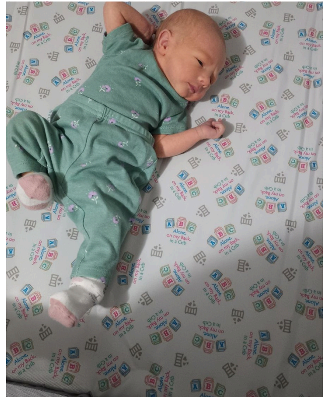
Baby Maelynn demonstrates safe sleep.

Dress your baby for the temperature – do not use loose blankets. Keep infants face and head uncovered during sleep/no hats, we want to avoid overheating the infant.